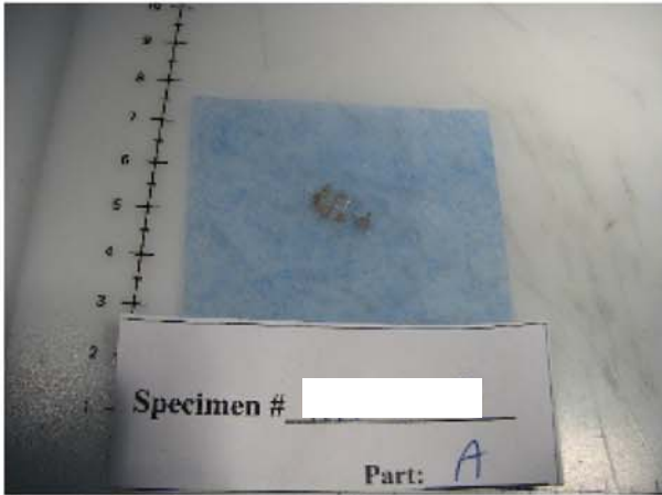
Figure 3: Grossing Image, H11-XXXX

Specimen "H11-XXXX" is received in 1 container, labeled with patient's name " Jane Doe " and "Bx. Mass Rectum". The specimen was taken on Dec 1, 2009 and received in buffered formalin on Dec 4, 2009 . The specimen consists of multiple pale tan tissue fragments, aggregating to 8mm in greatest diameter. The specimen is submitted entirely in block A1.